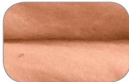
All-Natural Wool Liner For Breathability