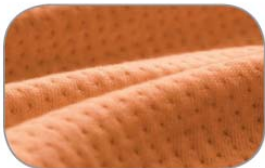
All-Natural Organic Stretch Cotton Cover