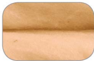
All-Natural Wool Liner For Breathability