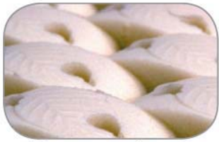
All-Natural Latex Foam Cushioning