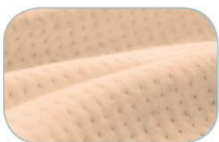
All-Natural Organic Stretch Cotton Cover