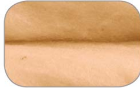
All-Natural Wool Liner For Breathability