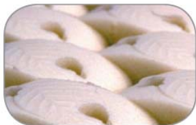
All-Natural Latex Foam Cushioning