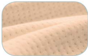
All-Natural Organic Stretch Cotton Cover